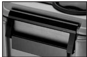
Durable full size nylon latches.