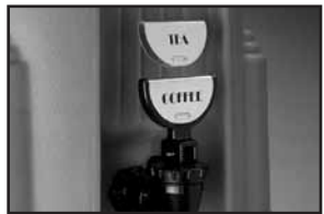
Attractive brass identity plate.