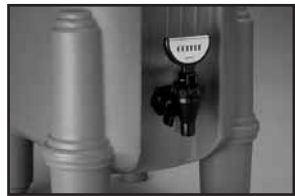
Convenient height dispenser.