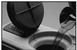
Convenient, safe top filling.